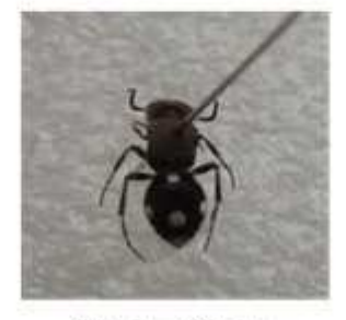
Unidentified sp Mutilidae